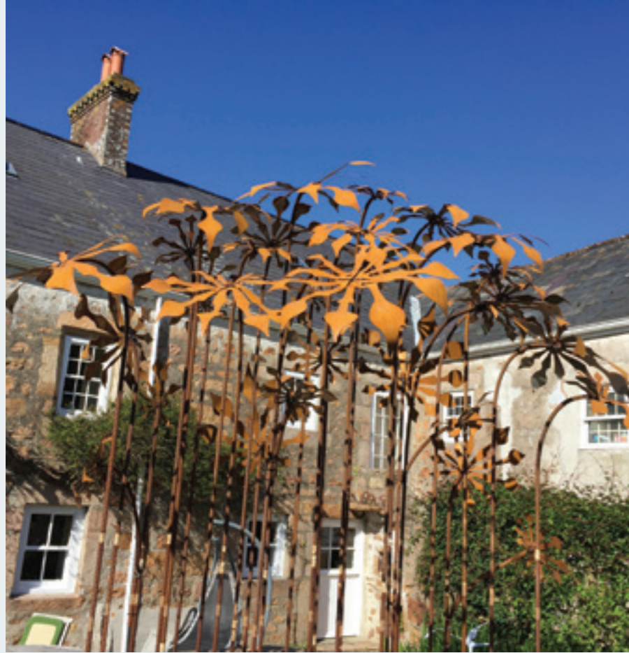
Leaves (Prototype) (2017) | 360 x 250cm | Steel, timber

This full scale prototype of the sculpture will be made out of marine grade mirror polished stainless steel and the underside of the leaves will be coloured and lit. The piece will be made at Romerils studio before being shipped and installed in a private garden in San Diego, California, USA.