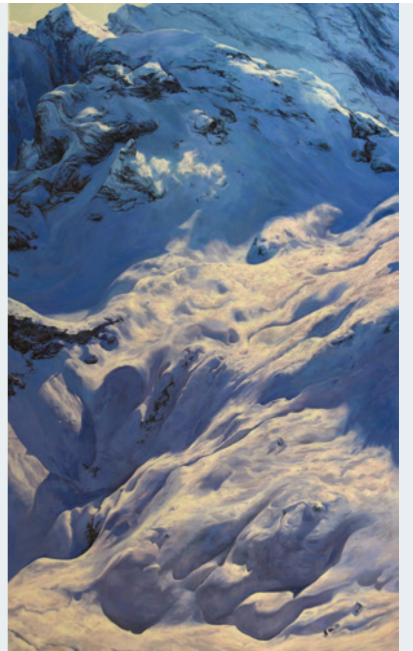
Massive Face (2016) | 150 x 90cm | Oil on linen