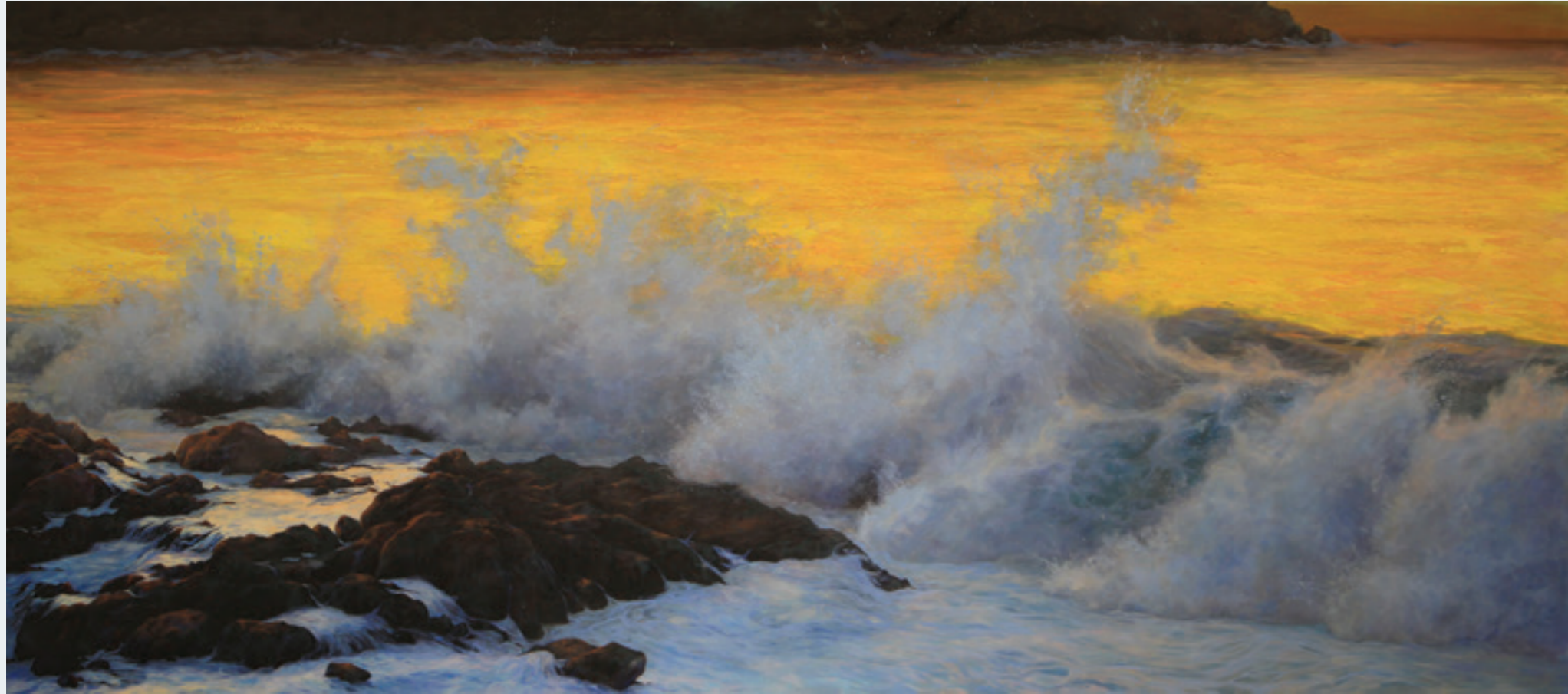
Gold Spirit (2016) | 90 x 180cm | Oil on Linen