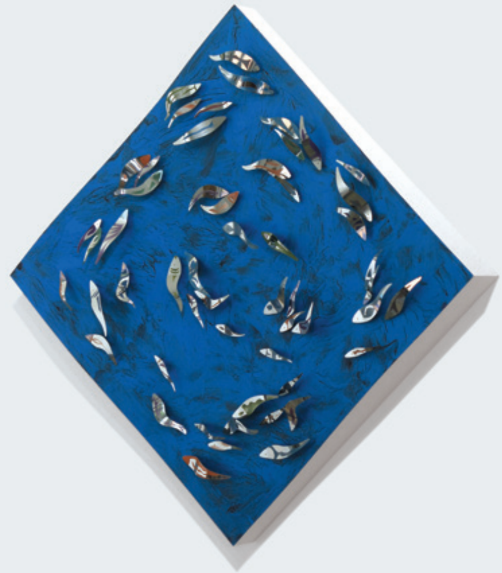
Fish on Blue No.2 (2017) | 140 x 140 x 18cm | Stainless steel, oil paint, MDF, timber, acrylic