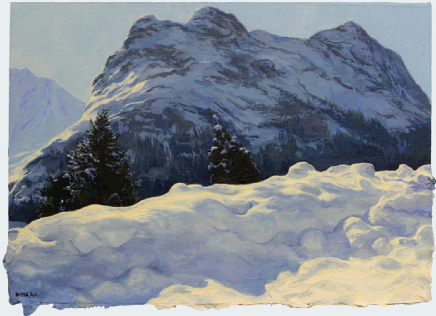
Soft Verge (2017) | 25.5 x 35.5cm | Oil on canvas