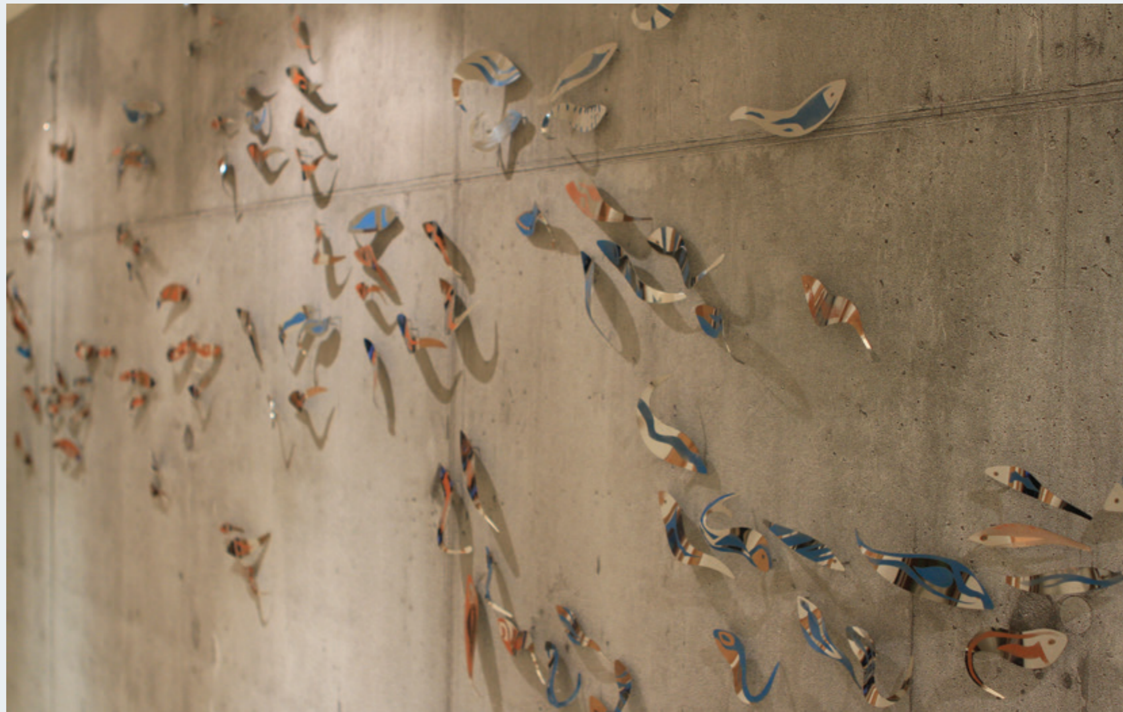
Fish on a Concrete Wall (2016) | Variable Size Stainless steel, oil paint, wallpaper

The fish are attached directly to the wall to enhance architectural features. Each fish is hand made and completely individual, resistant to temperature and ideal for positions where paintings will fade.