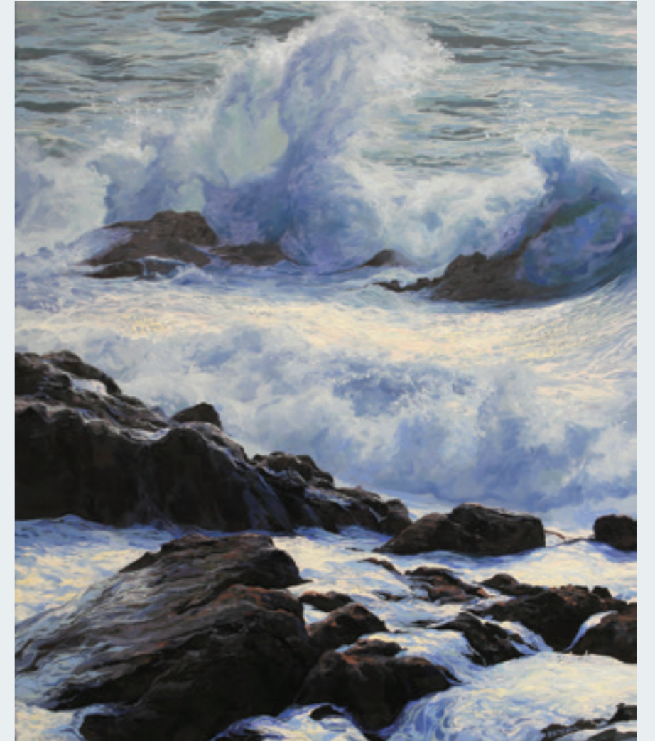
Clean Wind (2017) | 60 x 50cm | Oil on Linen