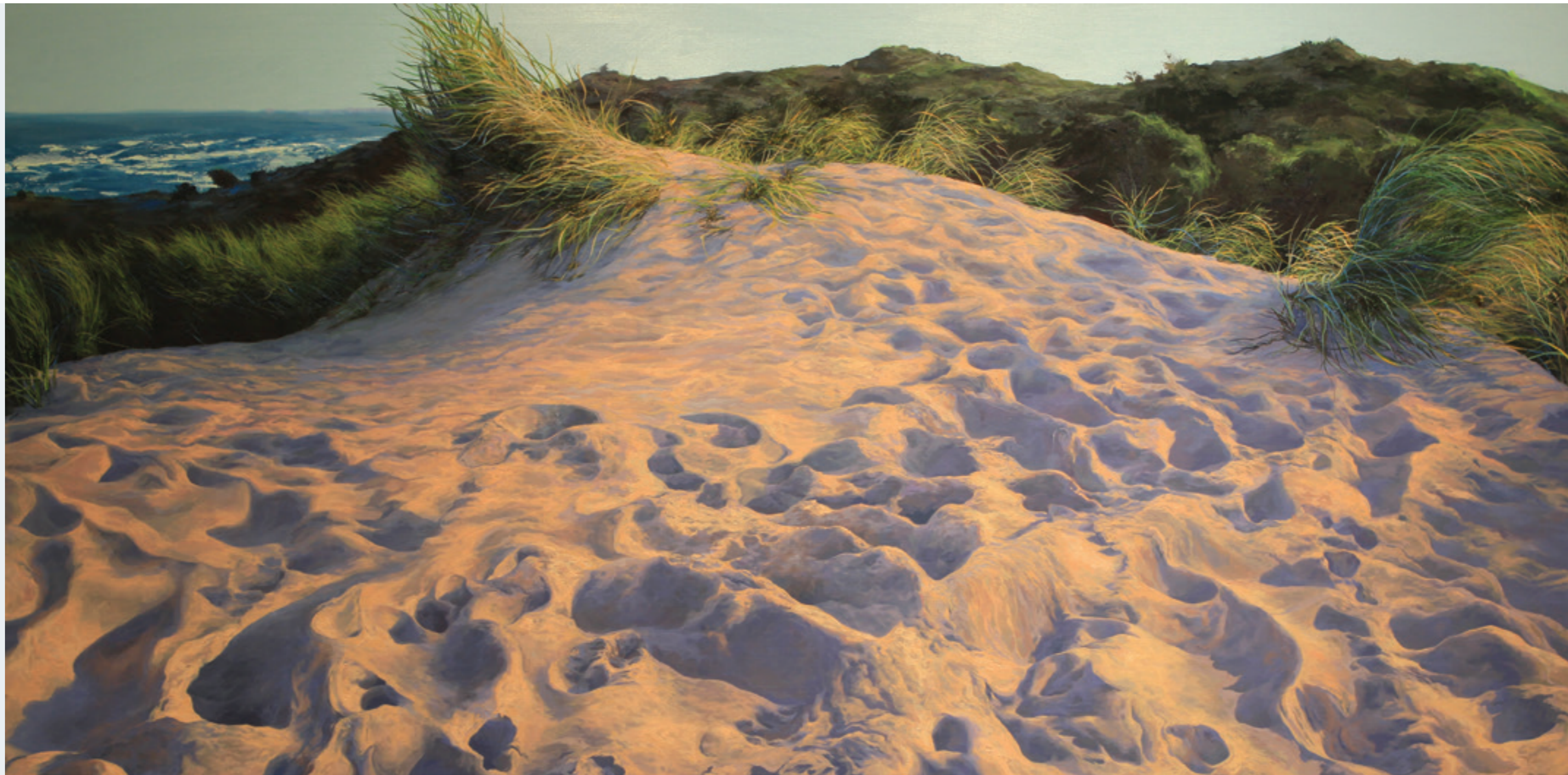
Only Natural (2017) | 90 x 180cm | Oil and artist's hair on linen