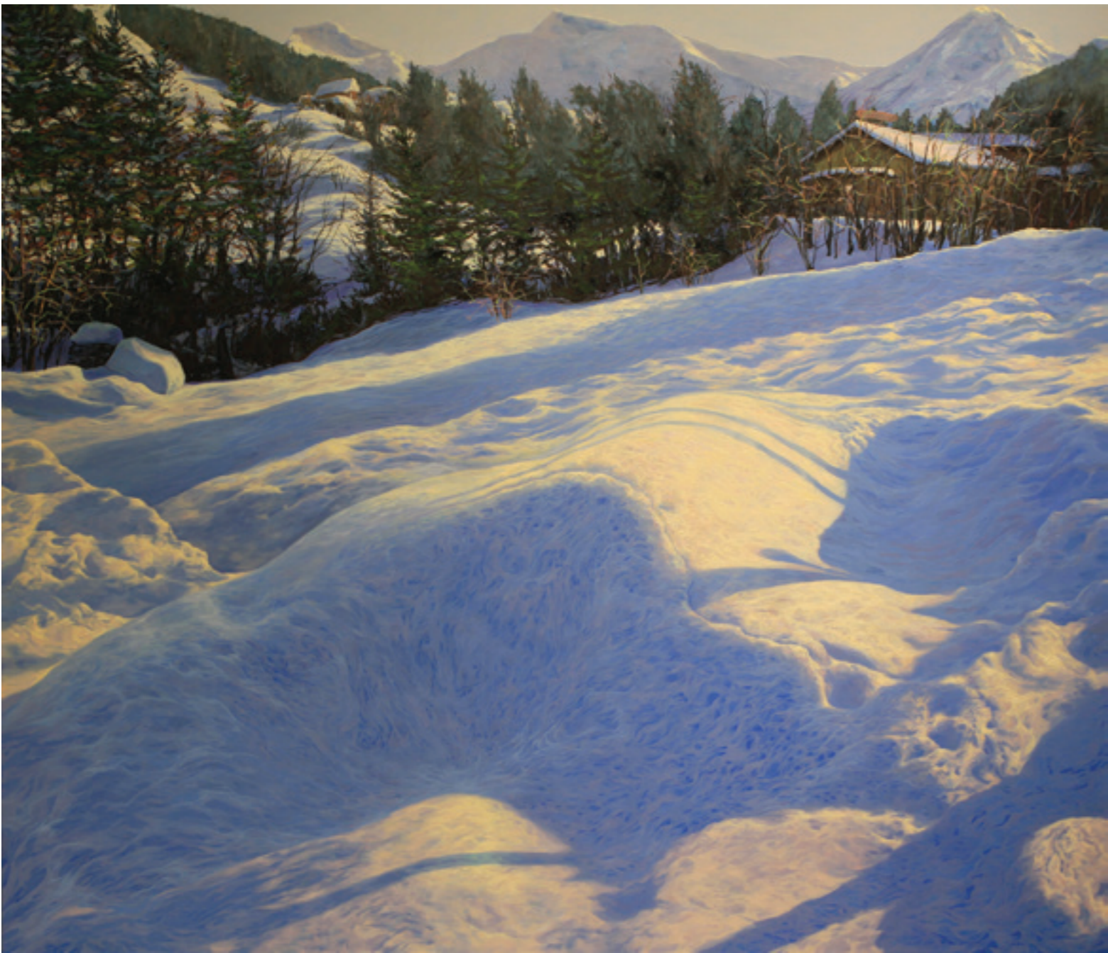
From the Side of the Road (2017) | 130 x 150cm | Oil and artist's hair on linen