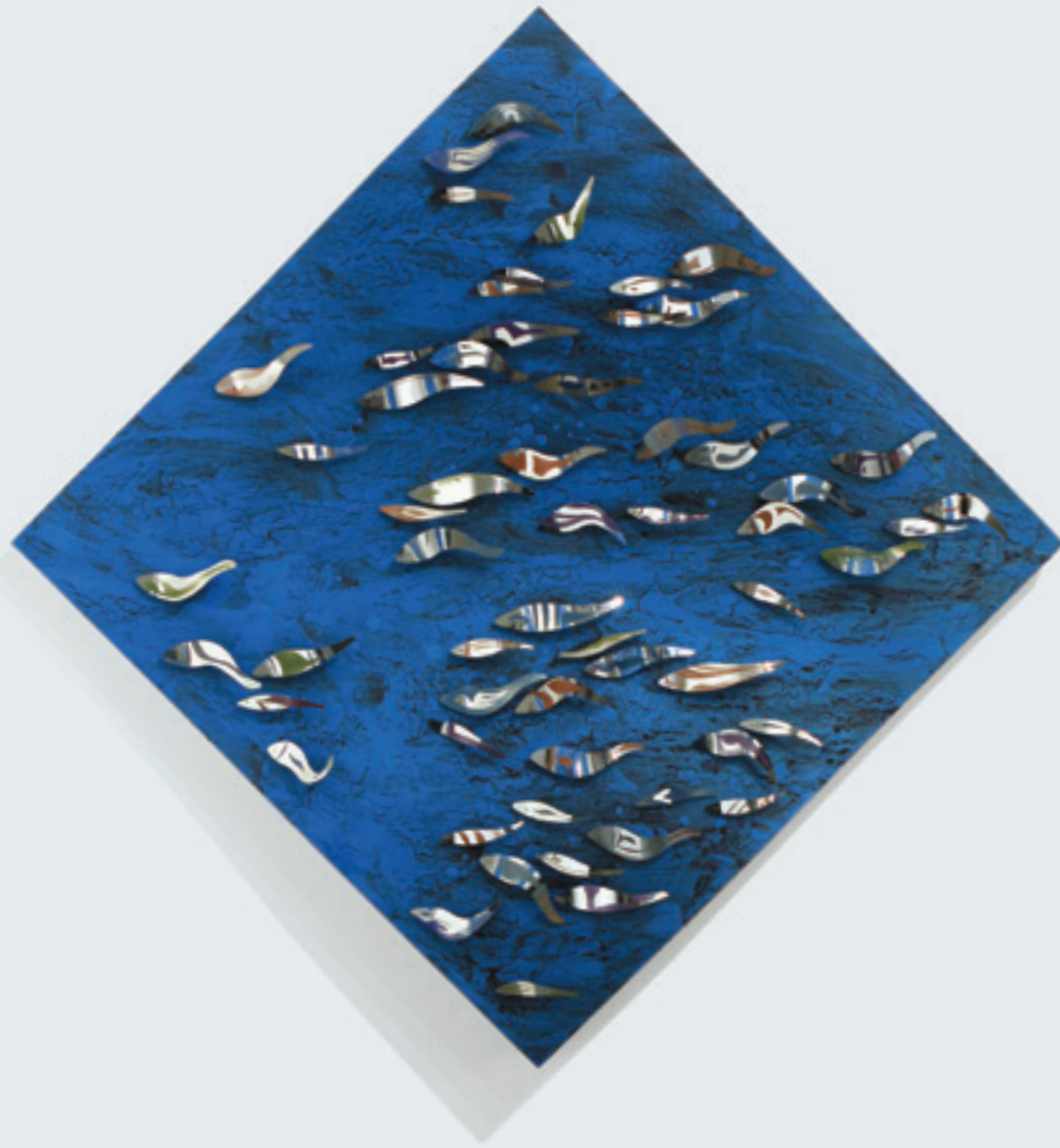
Fish on Blue No.1 (2017) | 140 x 140 x 18cm | Stainless steel, oil paint, MDF, timber, acrylic