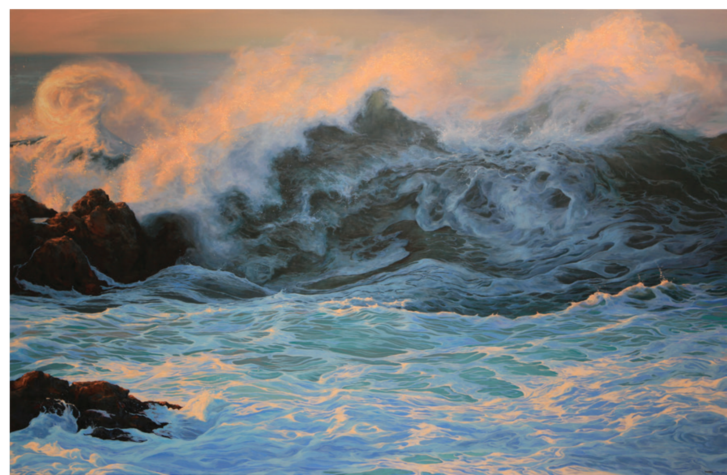
Wild and Steady (2017) | 130 x 200cm | Oil on Linen