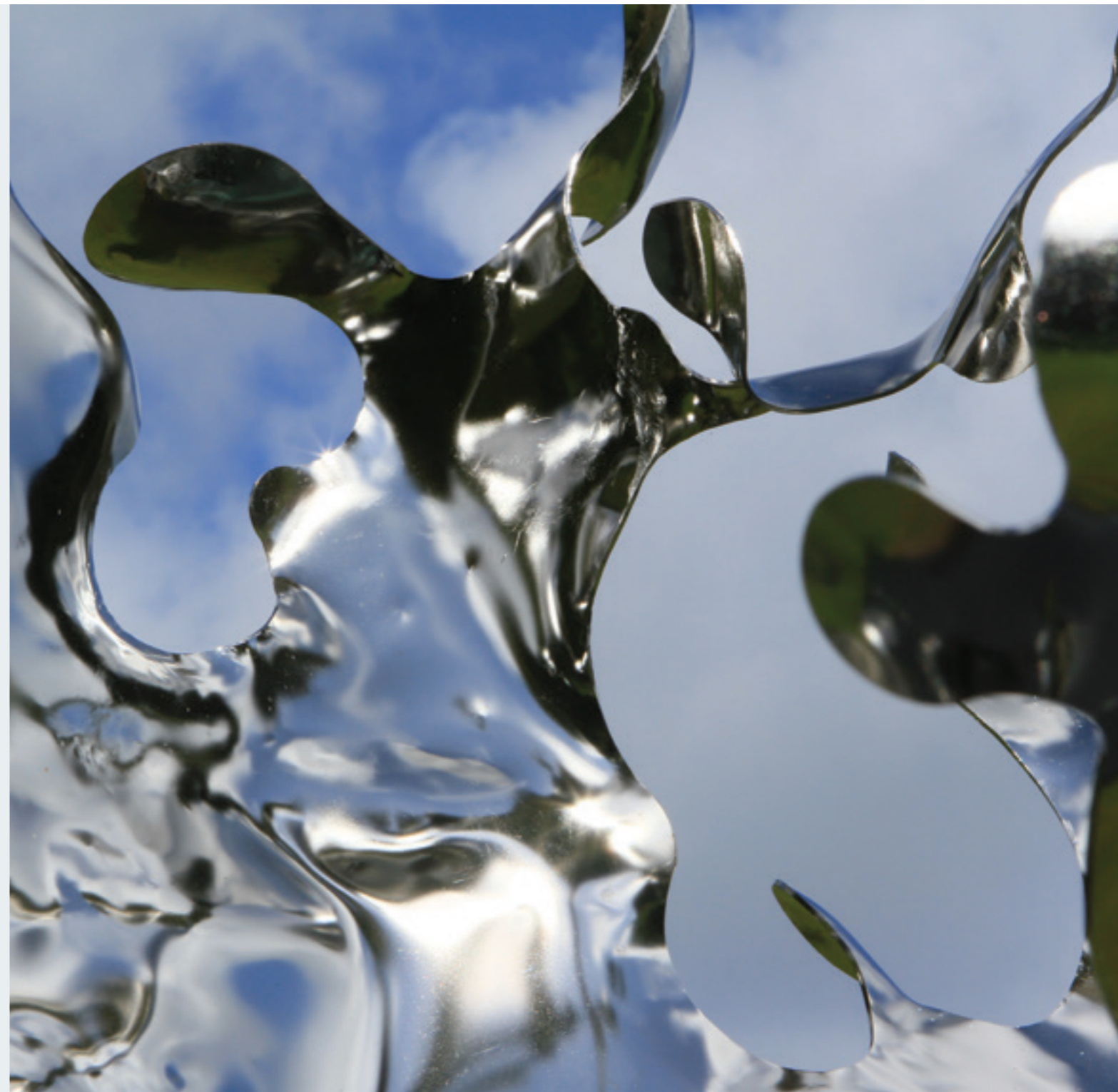
Splash, Free the Spirit (Display plinth until permanently installed) (2015) | 210 x 90 x 90cm | Stainless steel, copper, steel, timber, paint