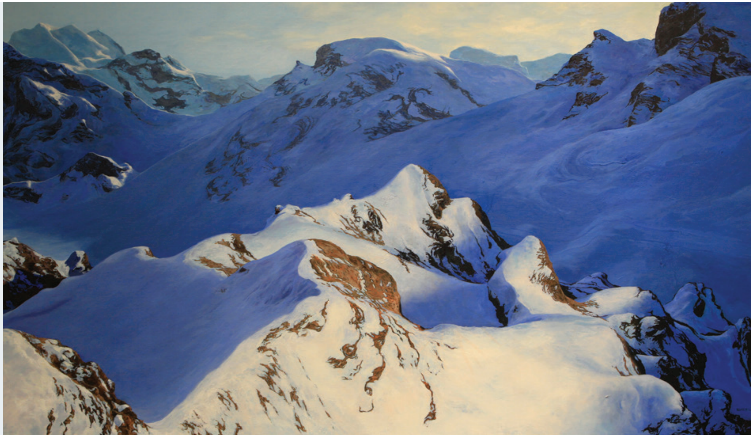
Free Fall (2017)

80 x 140cm | Oil and artist's hair on linen