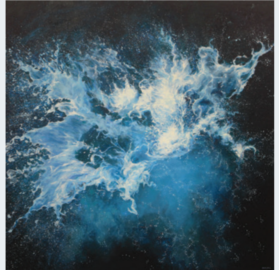
Jump (2017) | 110 x 110cm | Oil on Linen