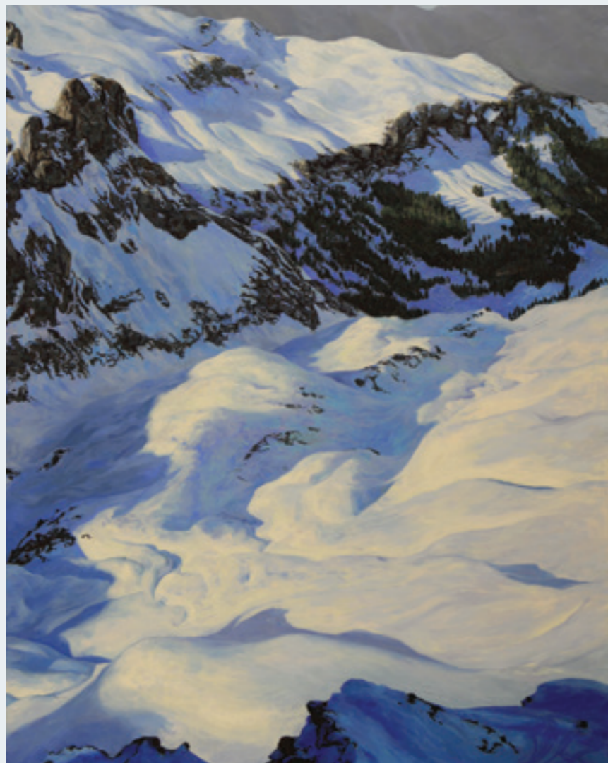
Down from Above (2017) | 80 x 60cm | Oil on linen