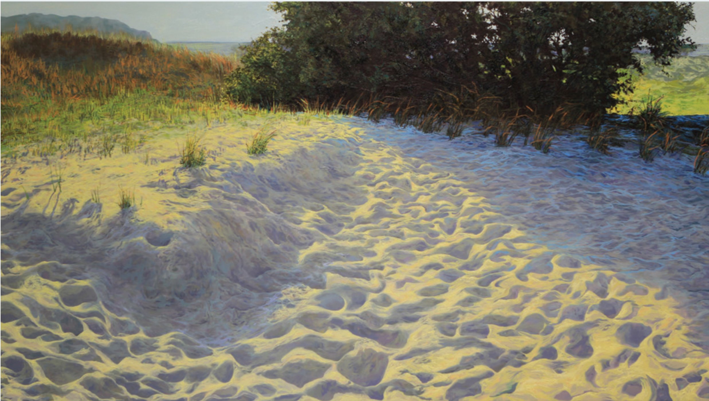
Common Faith (2017) 80 x 150cm | Oil and artist's hair on linen