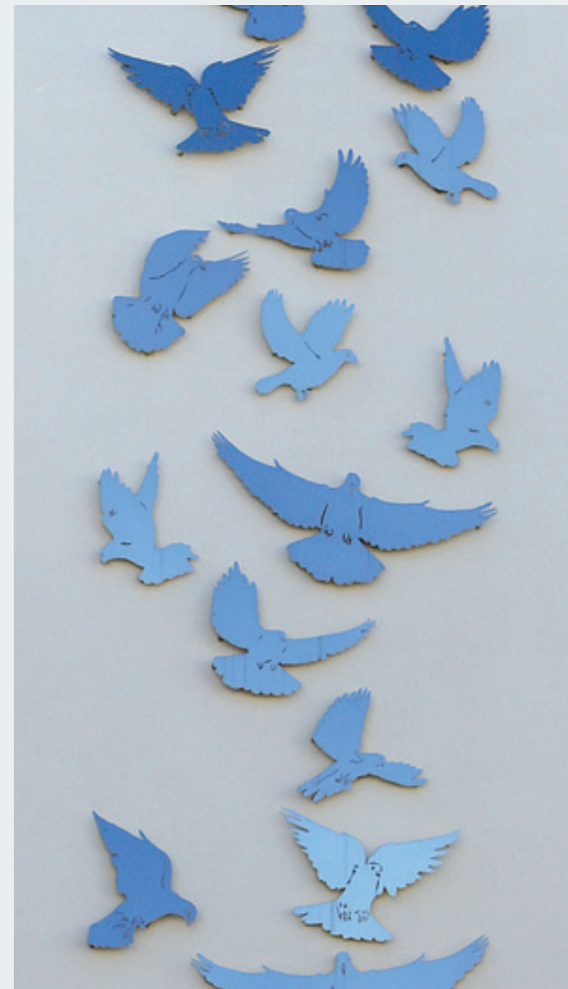
Doves at Pierre Arrivé House (2017) Variable Size | Stainless steel Collaboration with Private and Public Ltd and GR Langlois Ltd.

Kinetic wall sculpture for exteriors. Bespoke shapes and sizes can be made to fit any wall. A short video of this sculpture moving in the wind can be viewed at www.nicholasromeril.com/work/mesmerising-fish-wall