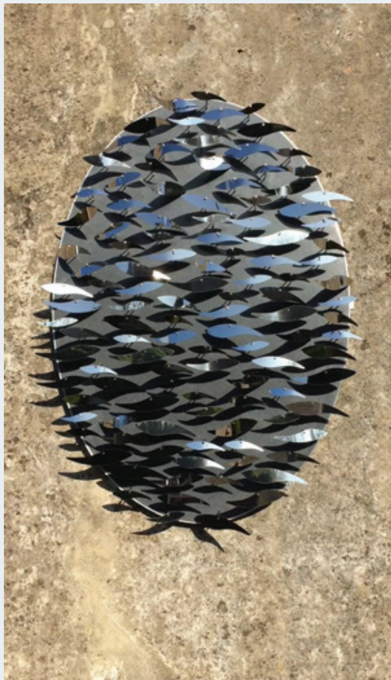
Mesmerising Fish (Powered by the Wind ) (2017) Variable Size Stainless steel on recycled board and aluminium frame

Kinetic wall sculpture for exteriors. Bespoke shapes and sizes can be made to fit any wall. A short video of this sculpture moving in the wind can be viewed at www.nicholasromeril.com/work/mesmerising-fish-wall