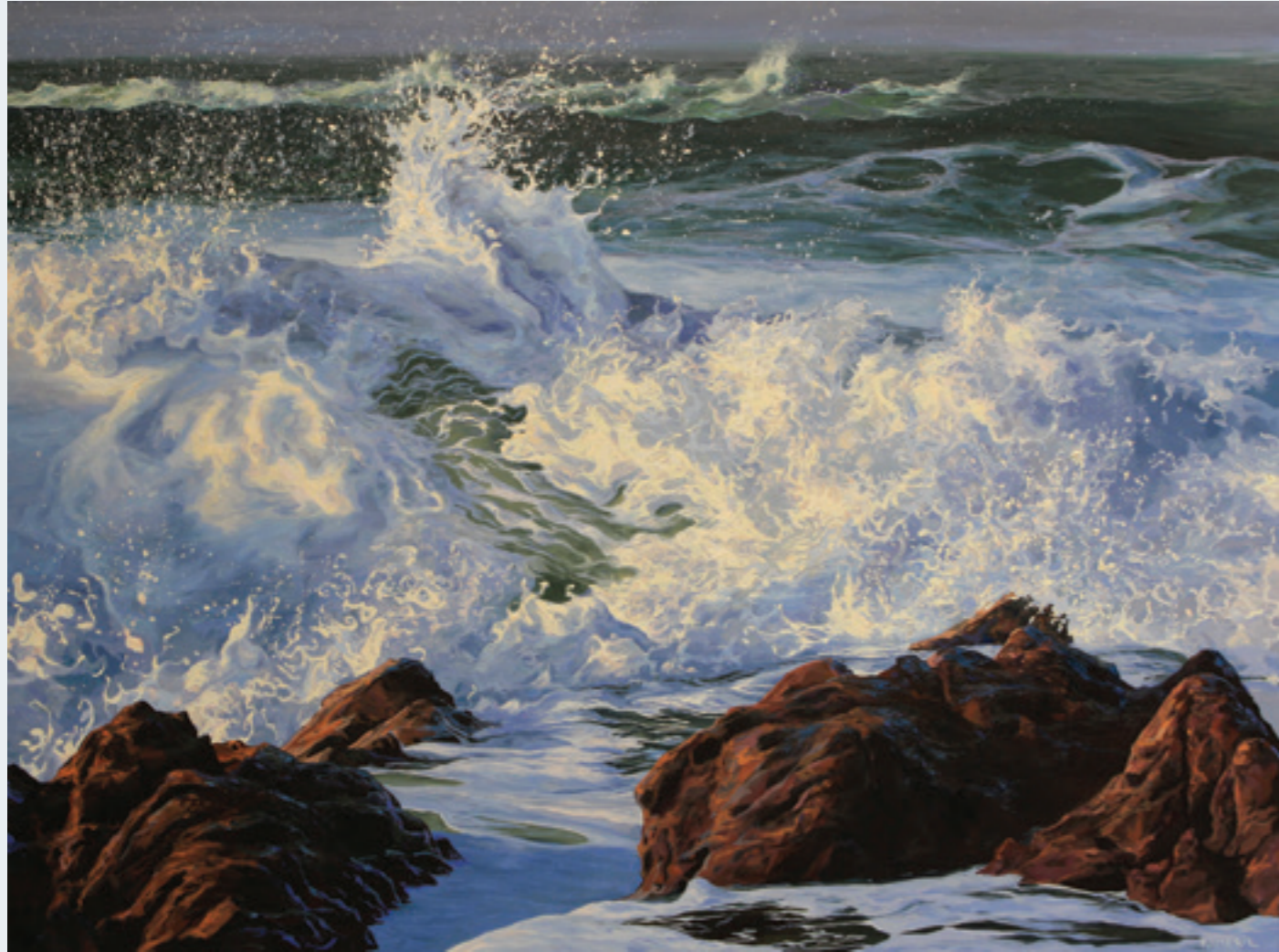
Small Waves (2017) | 60 x 80cm | Oil on Linen